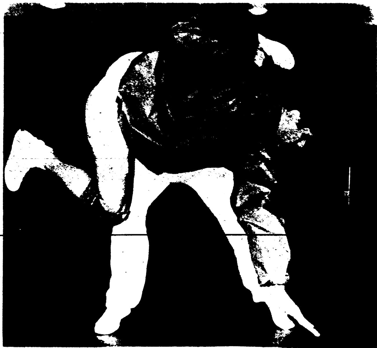
ONE OF THE FAVORITES — Ed Gomez, weighing in at 137 pounds, reaches for the mat as Alan Audus flips him and places the undefeated Gomez in a difficult predicament